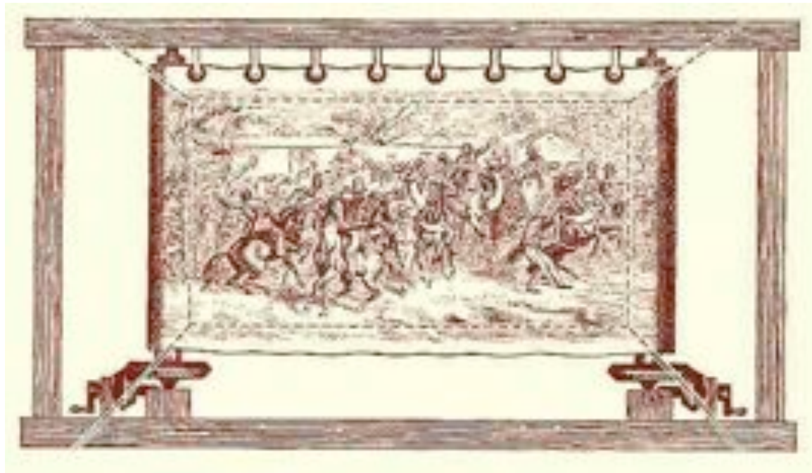
Image showing the mechanism for rolling a panorama across the stage.

In 1869 Gus painted a panorama titled "A Voyage Around the World". Panoramas were a series of scenes on canvases unrolled across the stage with the entertainer lecturing out front. Music, dancing, songs, juggling, and other artistry rounded out the entertainment.