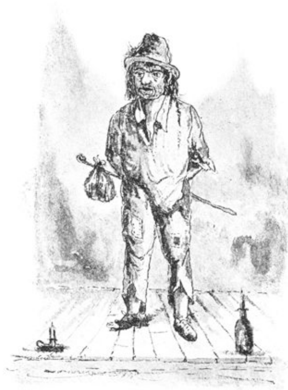
Here he is, on stage, one of many self-portraits in his memoir.

His interest in singing, dancing, 'hanky-panky' tricks and legerdemain, led him to the theatre and travelling shows. At Tarrengower, near Bendigo, a company entertaining local miners employed him to sing and act for a half-hour stint per night; during the day he helped with stage carpentry and scene painting.