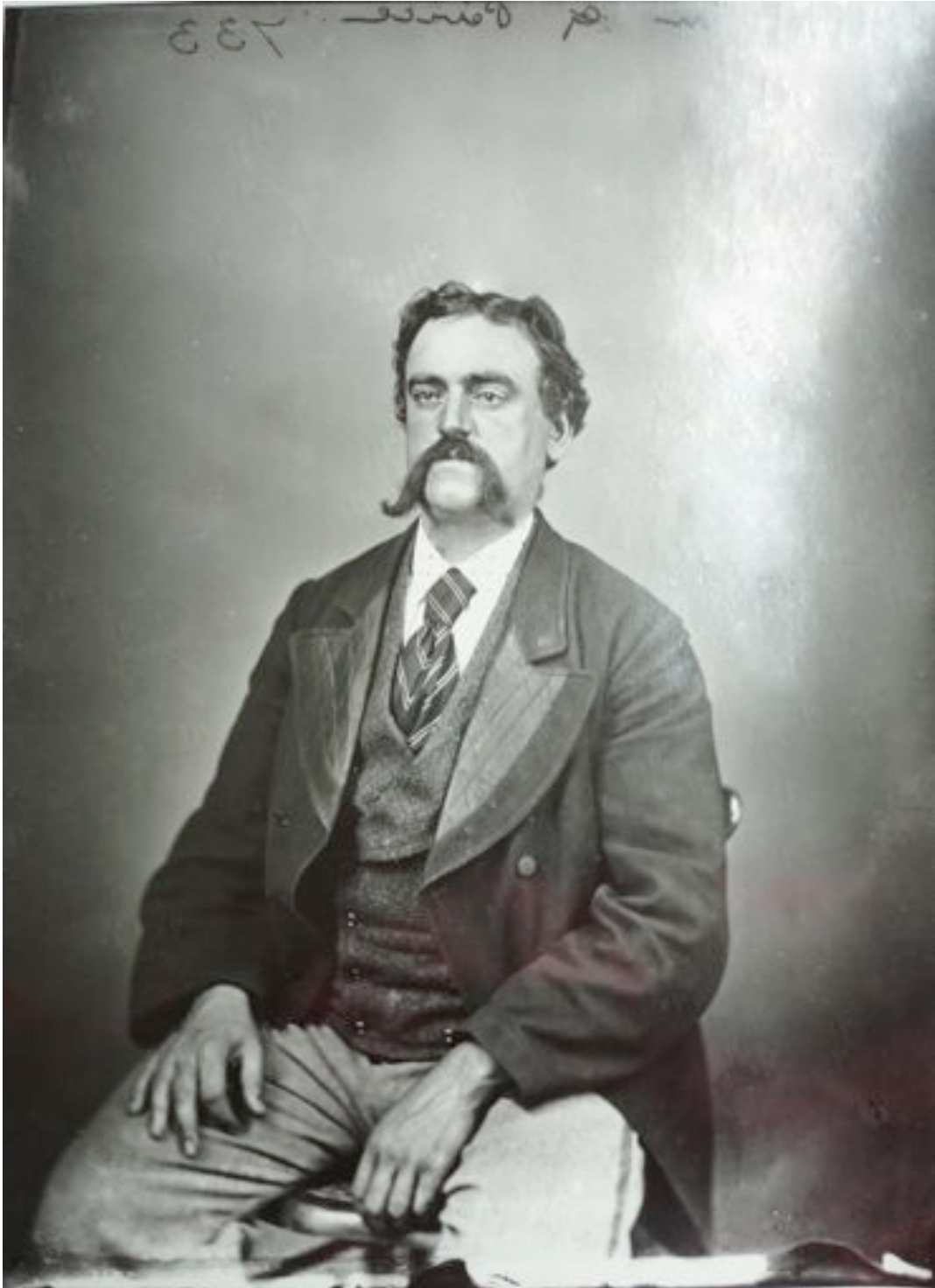
This photograph was taken in Hill End in 1872 by the American and Australasian Photographic Company, and is part of the Holtermann Collection at the Mitchell Library, Sydney.